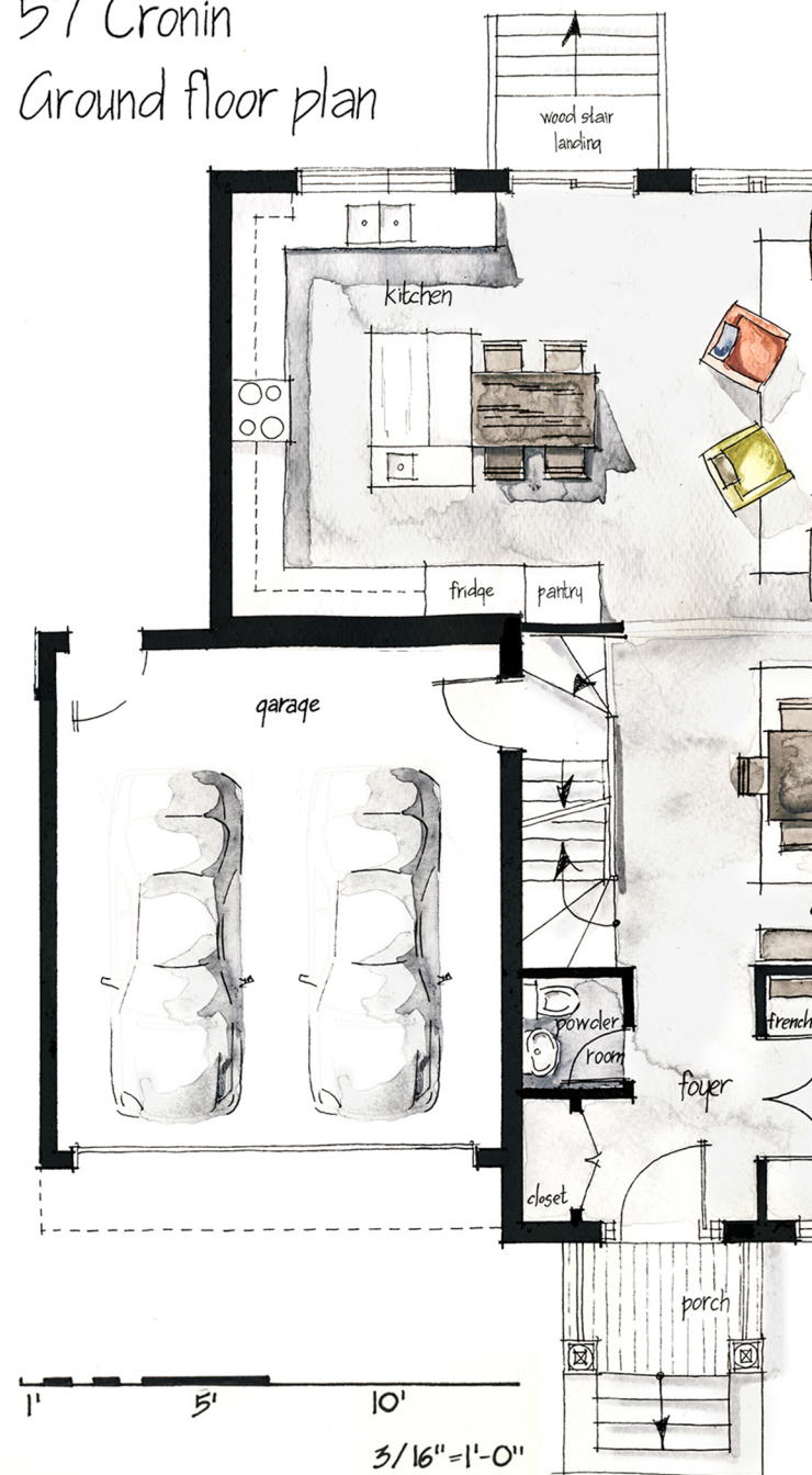
57 Cronin Ground floor plan

• 1 Hour estimate for full implementation of the design